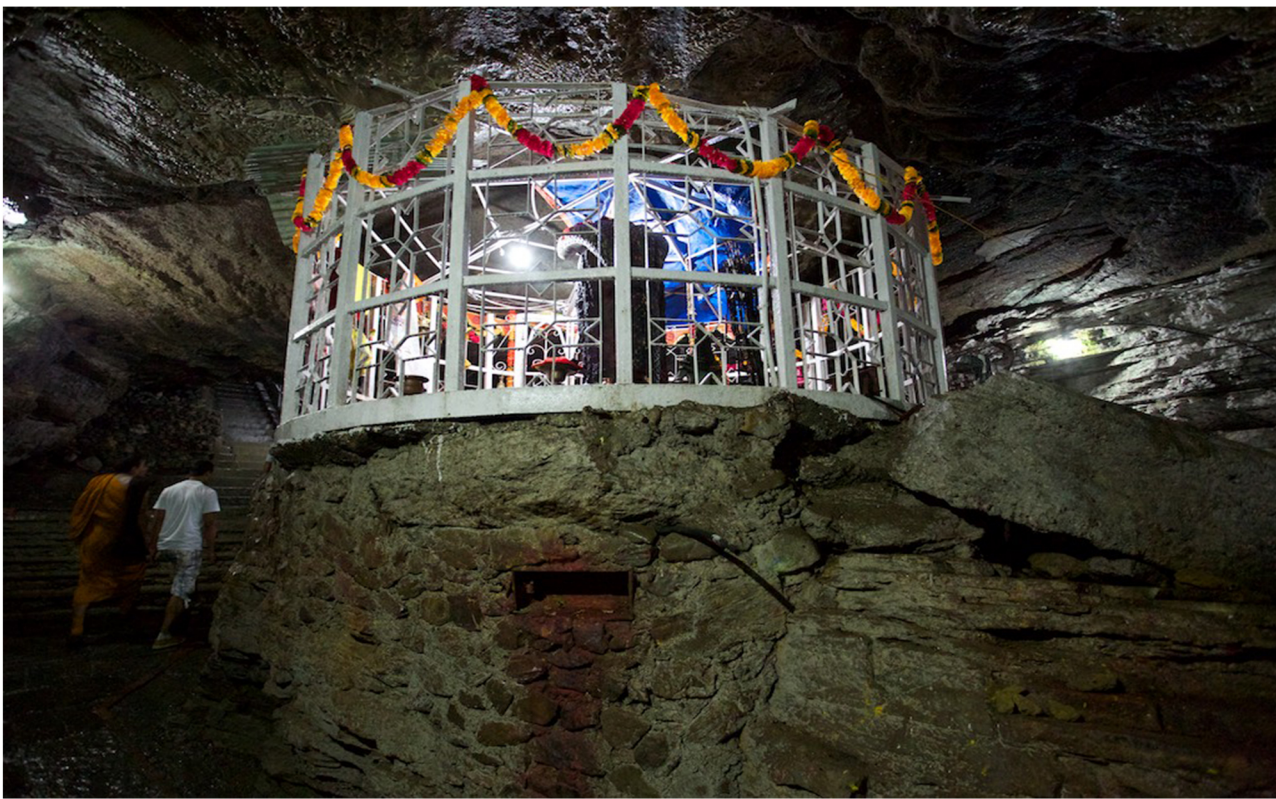
Gupteshwor Mahadev Cave