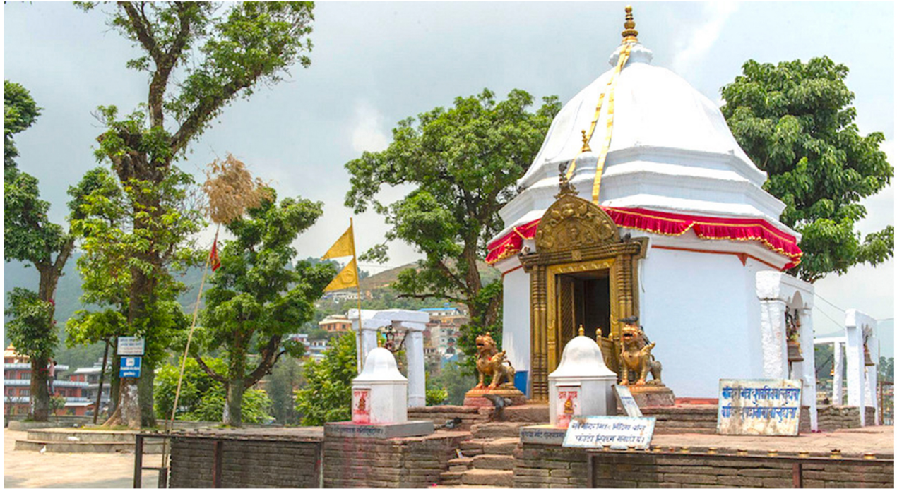
Bindabasini Bhagavati Temple