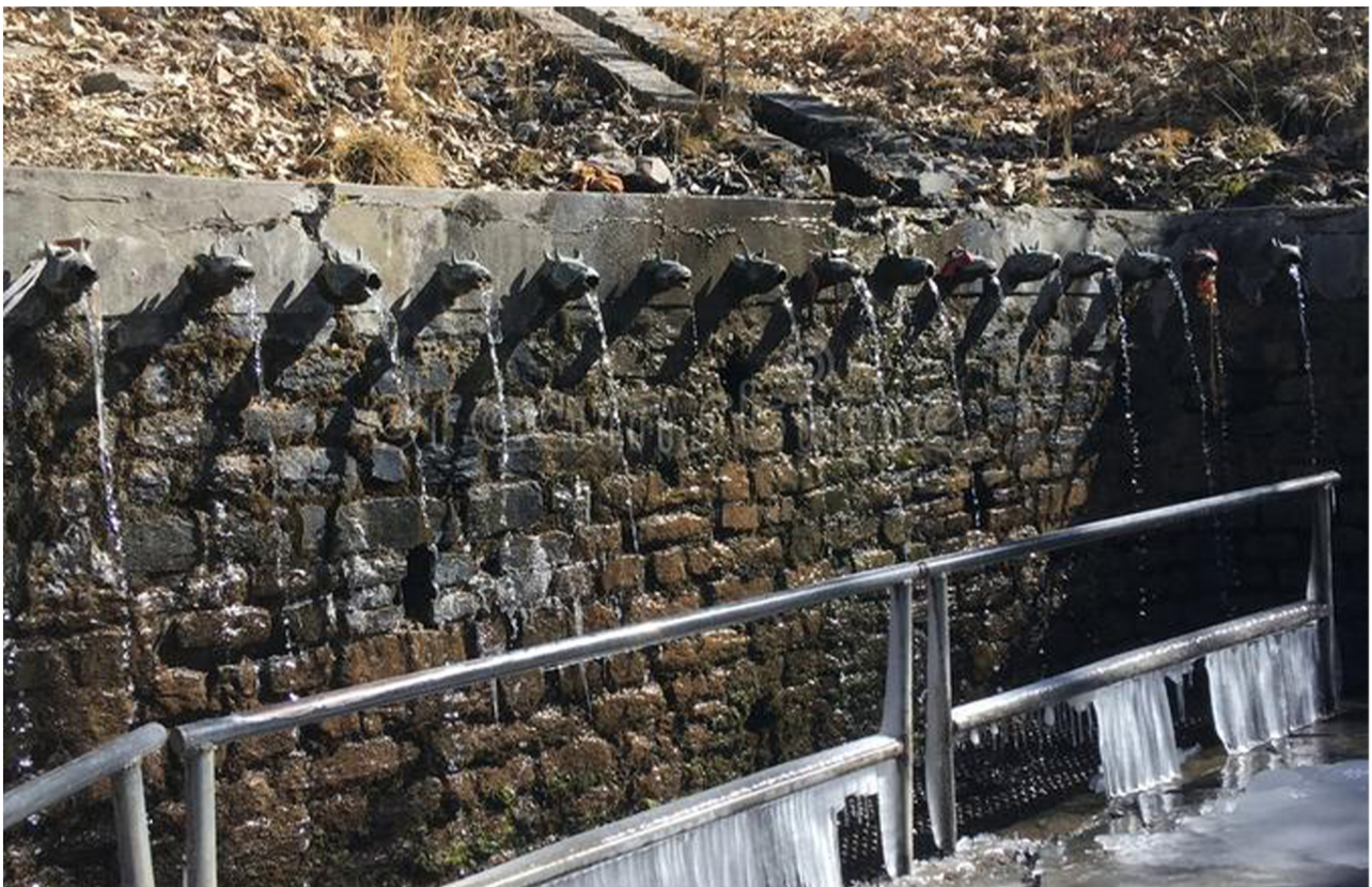
108 Holy Water Springs