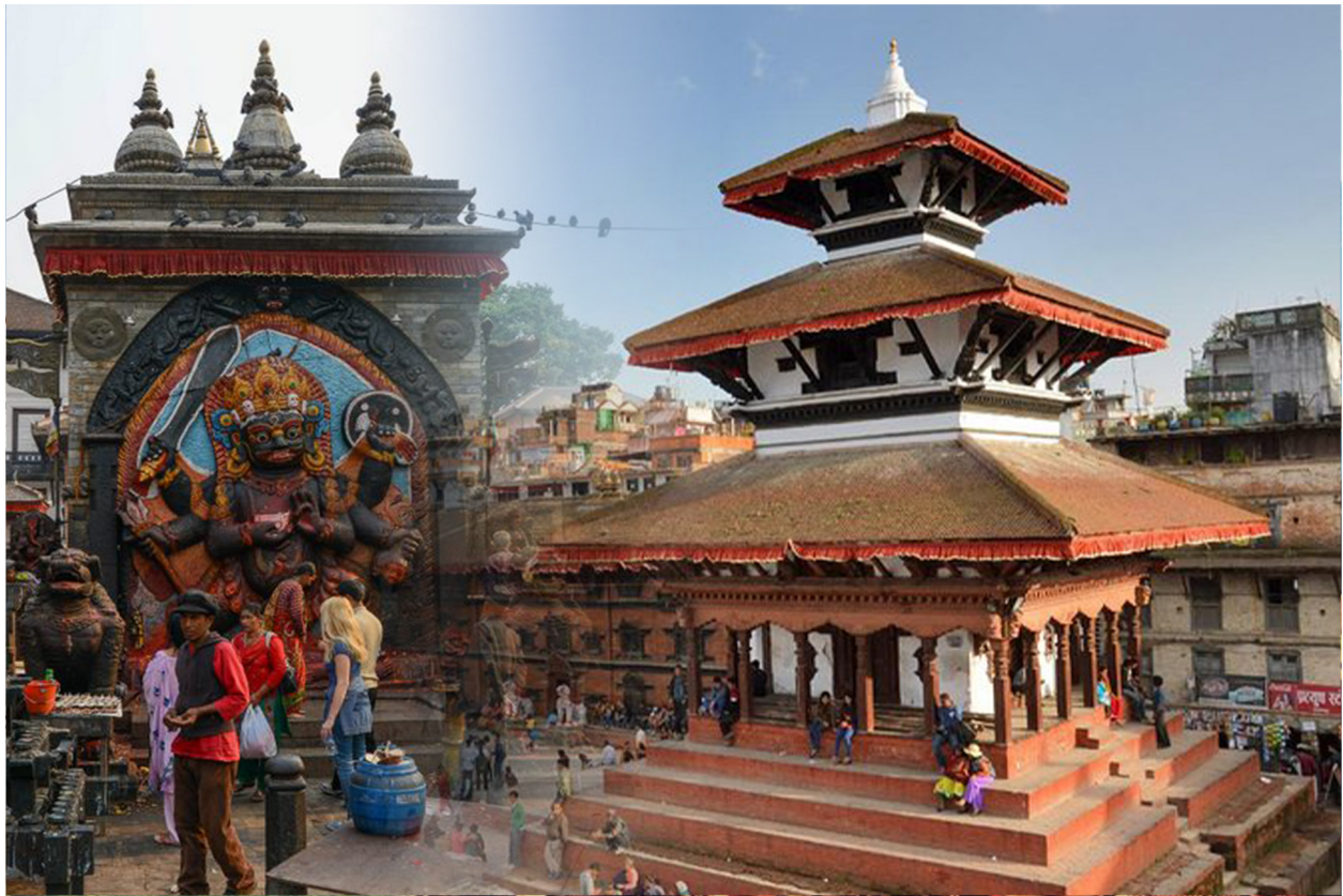
Kathmandu Durbar Square