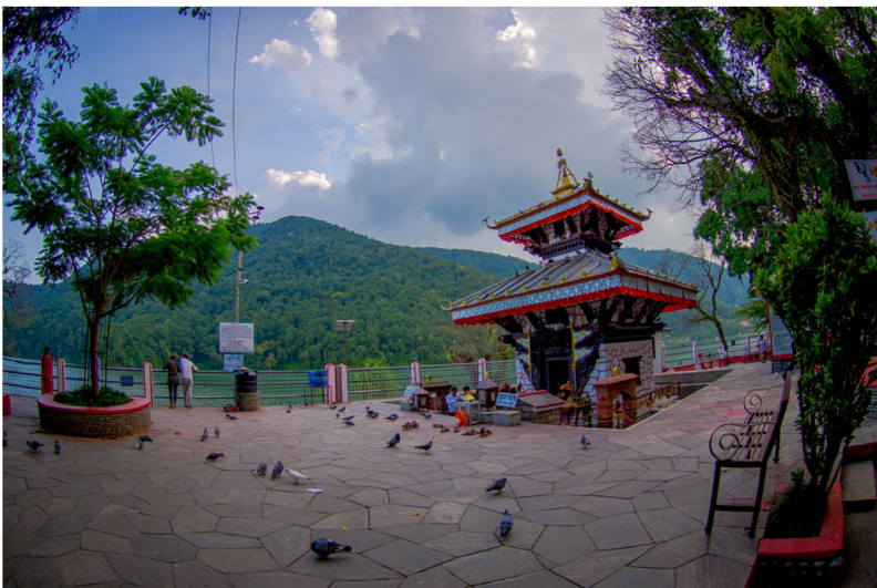
Tal Bahari Temple and Phewa Lake