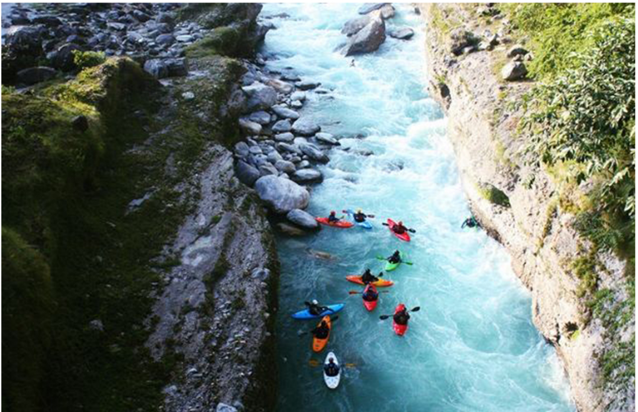
Seti Gorge River